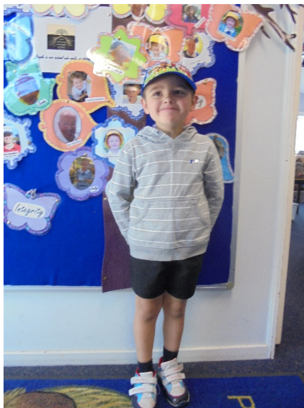
Ryda ready to start the day!