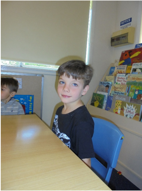
Jackson eager to learn!