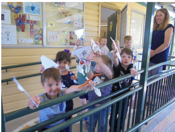
2018 Kindy Students showing off their work!