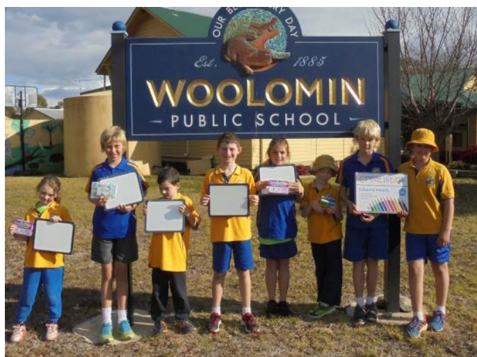
Students with some of the items donated to the Cambodian School.