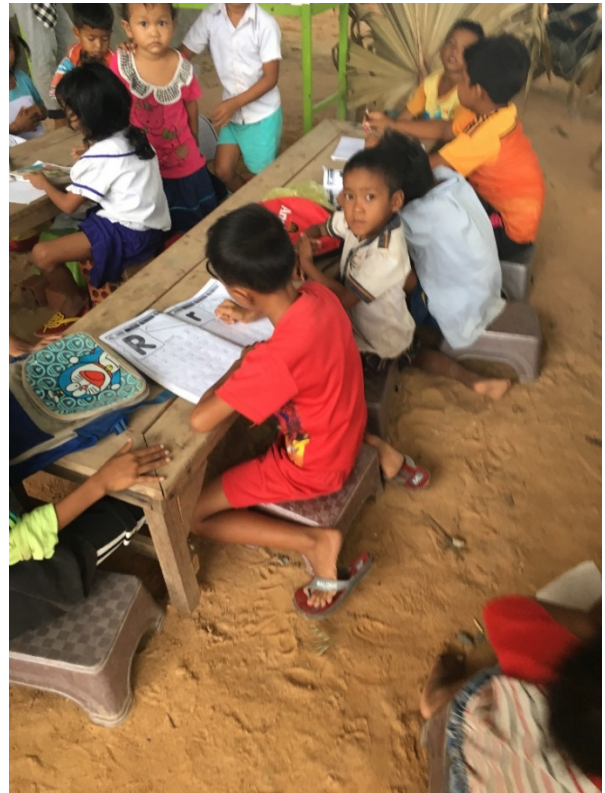
Students in class at the Opening Doors Village School, Cambodia

Another initiative is to support both these schools obtain basic teaching and learning resources that we often take for granted. When Mrs McMahon visited the schools in July, she delivered supplies of pens, pencils, rubbers, pencil sharpeners, dice, books and mini whiteboards. These supplies were handed directly to very grateful teachers and students. The schools were very basic compared to our standards and lacked the academic resources and environmental comforts that our staff and students enjoy every day.