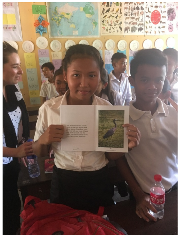
Students at the Happy Days School, Cambodia with a Native Australian Birds book donated by Woolomin PS.