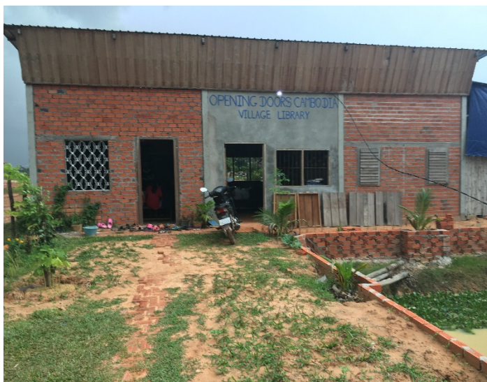
Cambodia Opening Doors Village School Classroom and Library